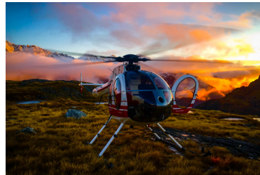
Alpine Hunting: New Zealand