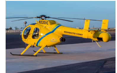
Volusia County (FL) Mosquito Control