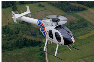
Belgian Federal Police