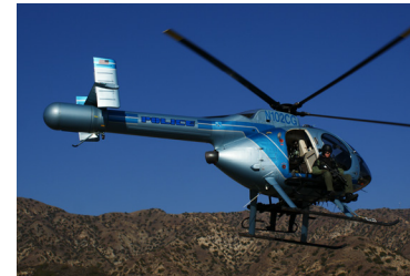
Burbank-Glendale Police Air Support Unit