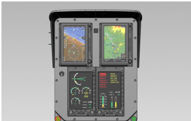
Glass Cockpit with Howell Instruments Engine Instruments Display & Garmin G500TXi MFD/PFD